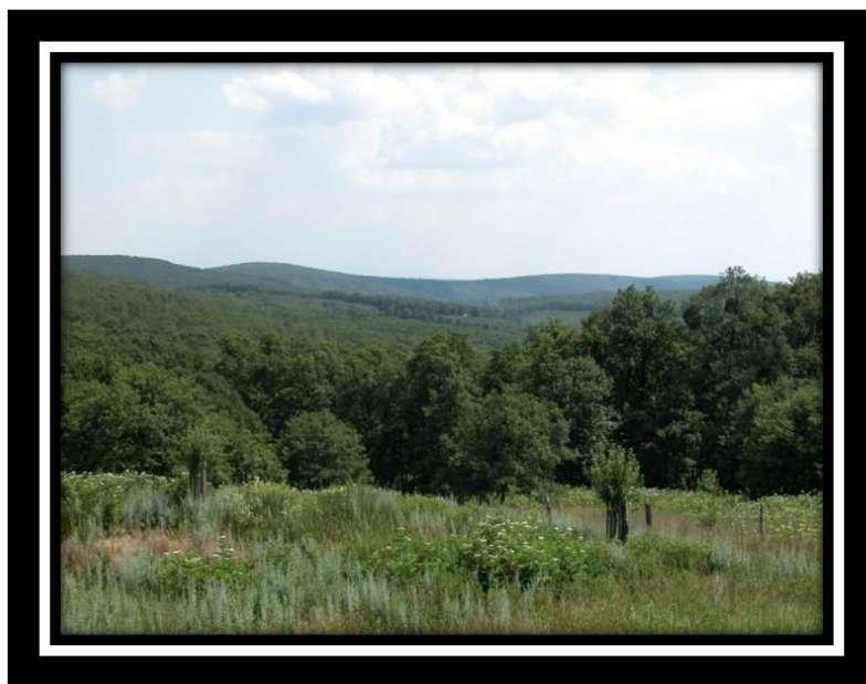
A view of hunting grounds n. 2

2,600 ha of hunting grounds (2,450 ha are forest stands) with an altitude from 300 to 500 metres above sea level. Southern slopes covered with oak forests gradually change into flat hillocks which steeply descend into the valleys of two rivers. The hunting area's northern part is characterized by colder biotopes with spruce, pine and linden. Red deer, mouflon as well as wild boar are present in this hunting grounds. In the period 2004-2014 nineteen gold trophy stags were shot here and ten gold trophy tuskers (120-130 CIC points). The historically strongest red deer trophy was 247 CIC points. Hunting guests stay in a hunting lodge which offers two double rooms, a common room with an open fireplace, kitchenette, shower and a toilet.