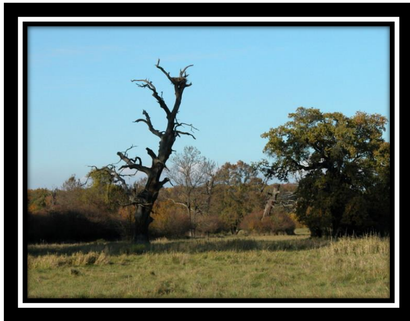
A view of hunting grounds n. 1