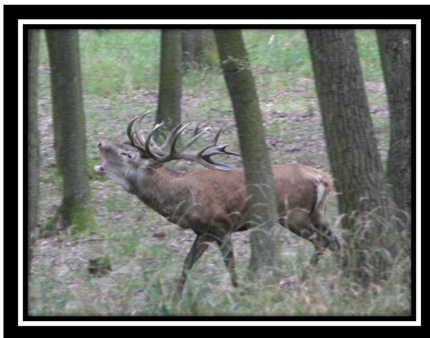
A Red Stag in the hunting grounds of this offer